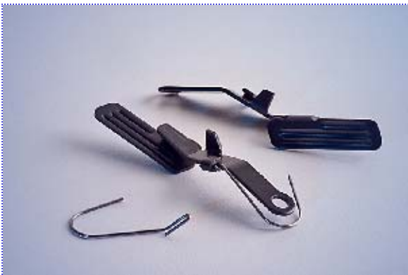
Slide Stop Lever