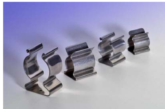
Retention Spring Clips