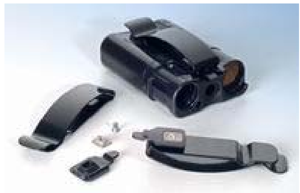
Low Profile Slip