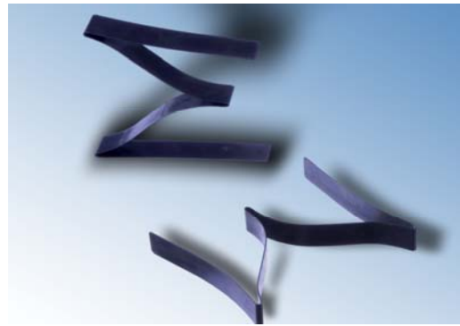
Flat M Springs