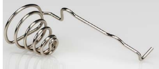
Medical Battery Contacts