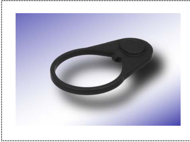
Receiver End Plate