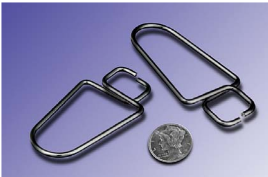
Wire Formed Clamps